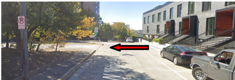
LMU Free Parking Lots on Cafego Place Traveling on Vine Avenue, turn left onto Locust Street