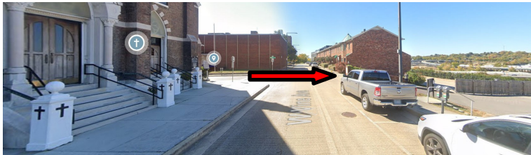
Entrance to Paid Parking Lot (Sterchi Lot) Traveling on Vine Avenue This is a third party managed parking lot.