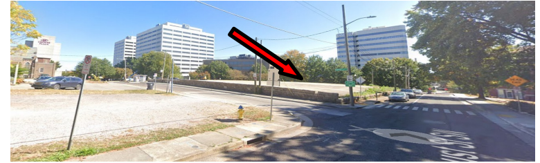
Free LMU Parking Lots Traveling on Locust Street, approaching Cafego Place