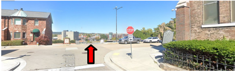
Entrance to Paid Parking Lot (Sterchi Lot) Traveling on Walnut Street This is a third party managed parking lot.