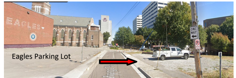
Entrance to Free LMU Parking Lot (Gravel Lot) Approaching on Cafego Place Free parking for evening (after 5 p.m.) & weekend events