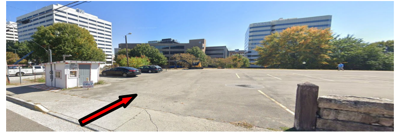
Entrance to Free LMU Parking Lot/Construction Staging Area Approaching on Cafego Place Free parking for evening (after 5 p.m.) & weekend events