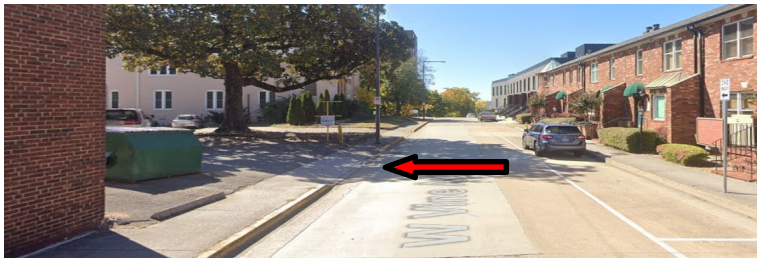
Entrance to Eagles Parking Lot Traveling on Vine Avenue Free parking on Sunday mornings